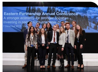
YEAs at the European Youth Event, Strasbourg, June 2018.