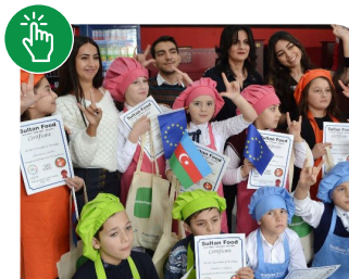
Cooking class in Baku, Azerbaijan in December 2018