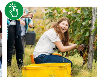
Supporting local winemakers in Georgia, October 2018