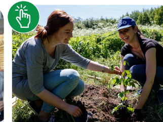
Planting trees in dedication of World Environment Day, Belarus, June 2018