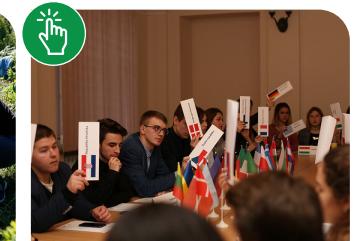
Meeting with local youth to discuss the EU, Ukraine, December 2018