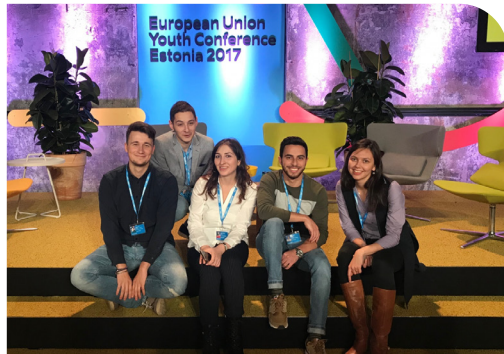
YEAs at the European Union Youth Conference in Estonia, October 2017