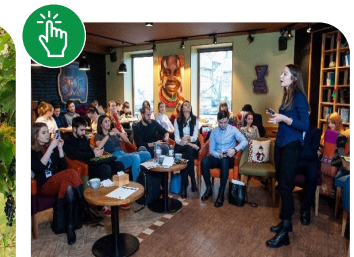
Sharing experiences in the Republic of Moldova, 2018