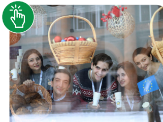
Talking Human Rights over a cup of coffee in Armenia, December 2018