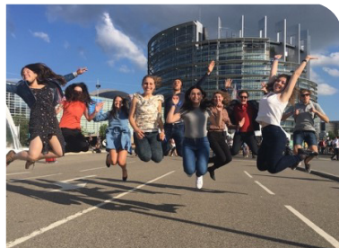
YEAs at the Eastern Partnership Annual Conference, Vienna, December 2018