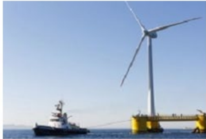
GWO, WIND ENERGY ON-SHORE & OFFSHORE SAFETY TRAINING