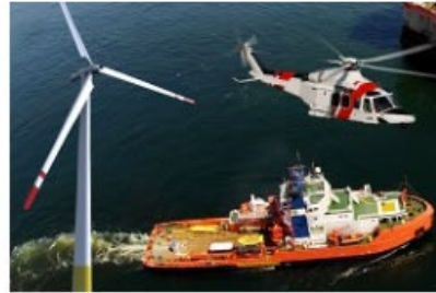
OPITO, OIL & GAS, OFFSHORE SAFETY TRAINING