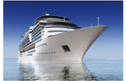
STCW, MARINE, PASSENGER & CARGO SHIP SAFETY & SECURITY TRAINING