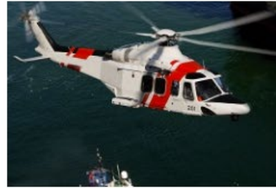
AVIATION, HELICOPTER & AIRCRAFT SAFETY TRAINING